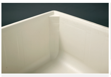
Better sanitation and reduced contamination Smooth, nonporous surfaces

Smooth, nonporous surfaces are easy to sanitize and won't trap debris, breed bacteria, or absorb chemicals like wood bins.