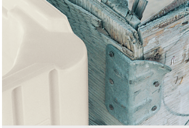
Improved pack out Rounded corners and smooth surfaces mean fewer scuffs, abrasions, and cuts on your product.