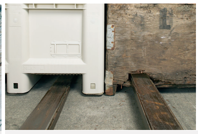
Reduced bin repair costs ProBins are virtually maintenance free; repairs are easy with hot air welding.